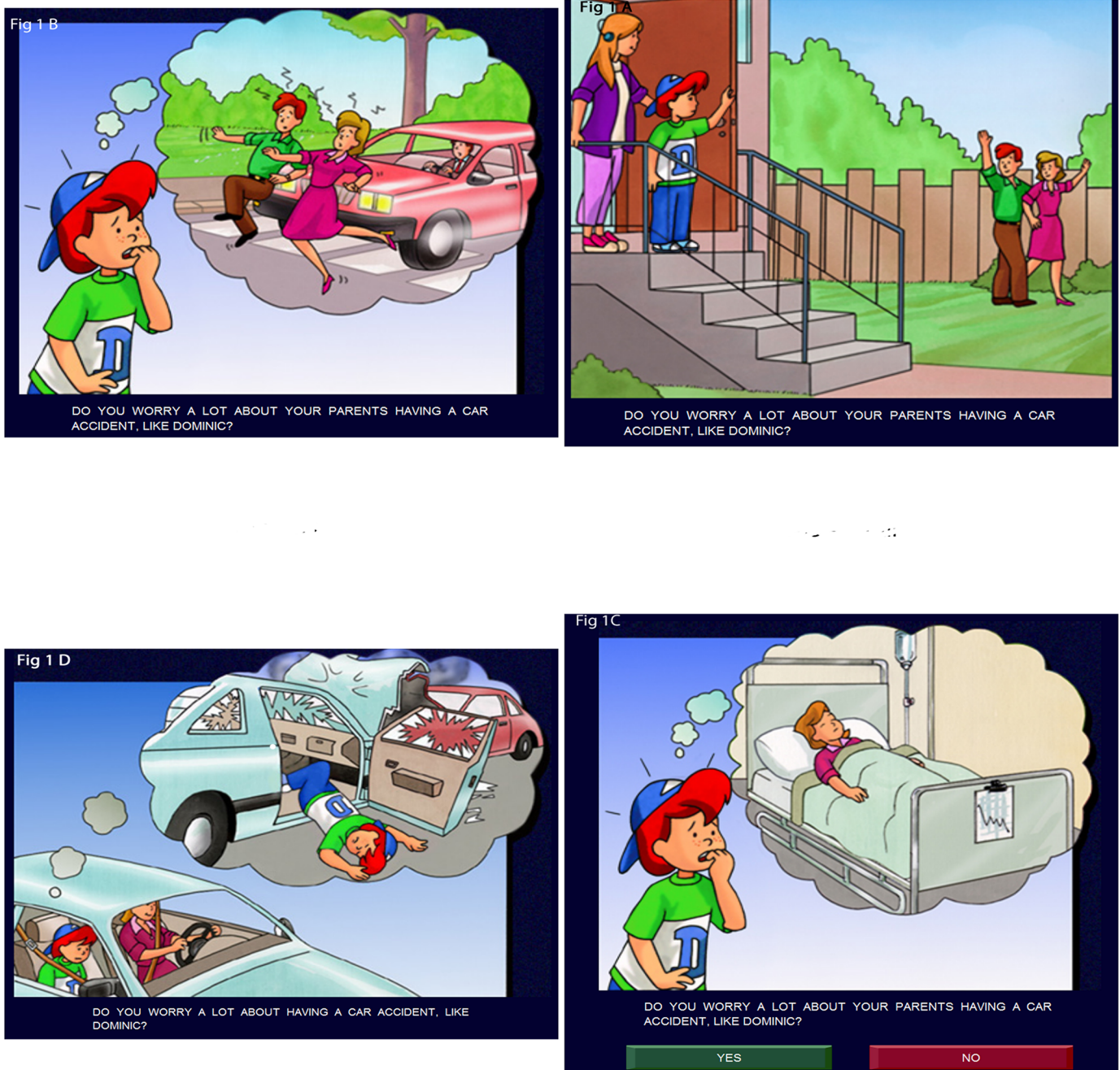
Fig 1. Pictures and text illustrating DI survey questions. (A-C) accompany, “Do you worry a lot about your parents having a car accident, like Dominic?”, whereas (D) accompanies the question, “Do you worry a lot about having a car accident, like Dominic?”. Reprinted from the Dominic Interactive under a CC BY license, with permission from DIMAT.

https://doi.org/10.1371/journal.pone.0181619.g001