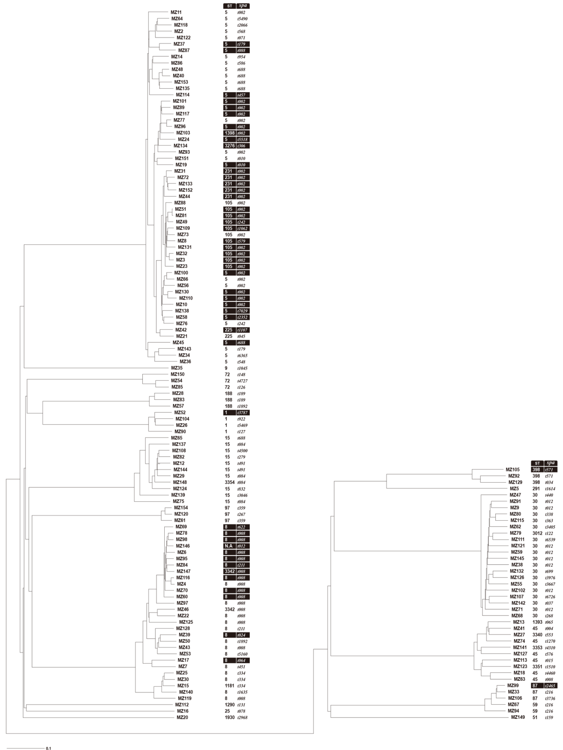
Fig 3. Phylogenetic tree of cgMLST analysis generated using the neighbor-joining method compared to MLST (ST) and traditional spa typing (spa) for 152 Staphylococcus aureus bacteremia isolates. cgMLST analysis was based on allelic profiles as determined using SeqSphere+ software. N.A., not available. Methicillin-resistant isolates are highlighted in black.

https://doi.org/10.1371/journal.pone.0179003.g003