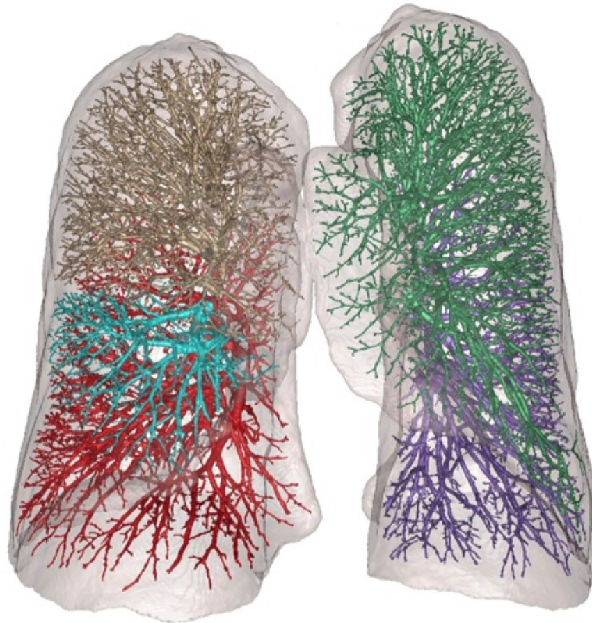
Fig 1. 3-dimensional reconstruction of the vessels comprising the total pulmonary vascular volume and the lungs on CT scan. Colors depict the 5 lobes of the lungs; shaded region, the lung volume.

https://doi.org/10.1371/journal.pone.0176180.g001