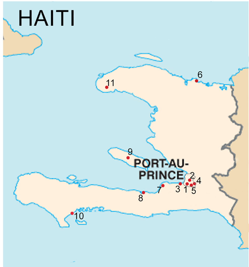
Fig 1. Map of included HIV facilities (N = 11) in Haiti.

https://doi.org/10.1371/journal.pone.0175521.g001