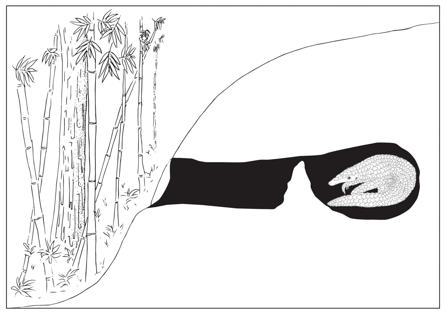
Fig 1. Manis pentadactyla burrow. Illustration of Manis pentadactyla burrow with barrier. Figure is not drawn to scale.

https://doi.org/10.1371/journal.pone.0175450.g001