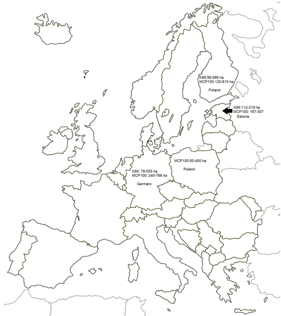
Fig 2. Home range sizes of raccoon dogs from different areas in Europe. K95—95% kernel home range; MCP100—100% minimum convex polygon; ha—hectares. Estonia—this study. Finland—Holmala and Kauhala 2009; Kauhala and Auttila 2010; Kauhala et al. 2010; Kauhala and Holmala 2008; Kauhala et al. 1993. Mustonen et al. 2012; Poland—Jedrzejewska and Jedrzejewski 1998. Germany—Drygala and Zoller 2013; Sutor and Schwarz 2012; Drygala et al. 2008a.