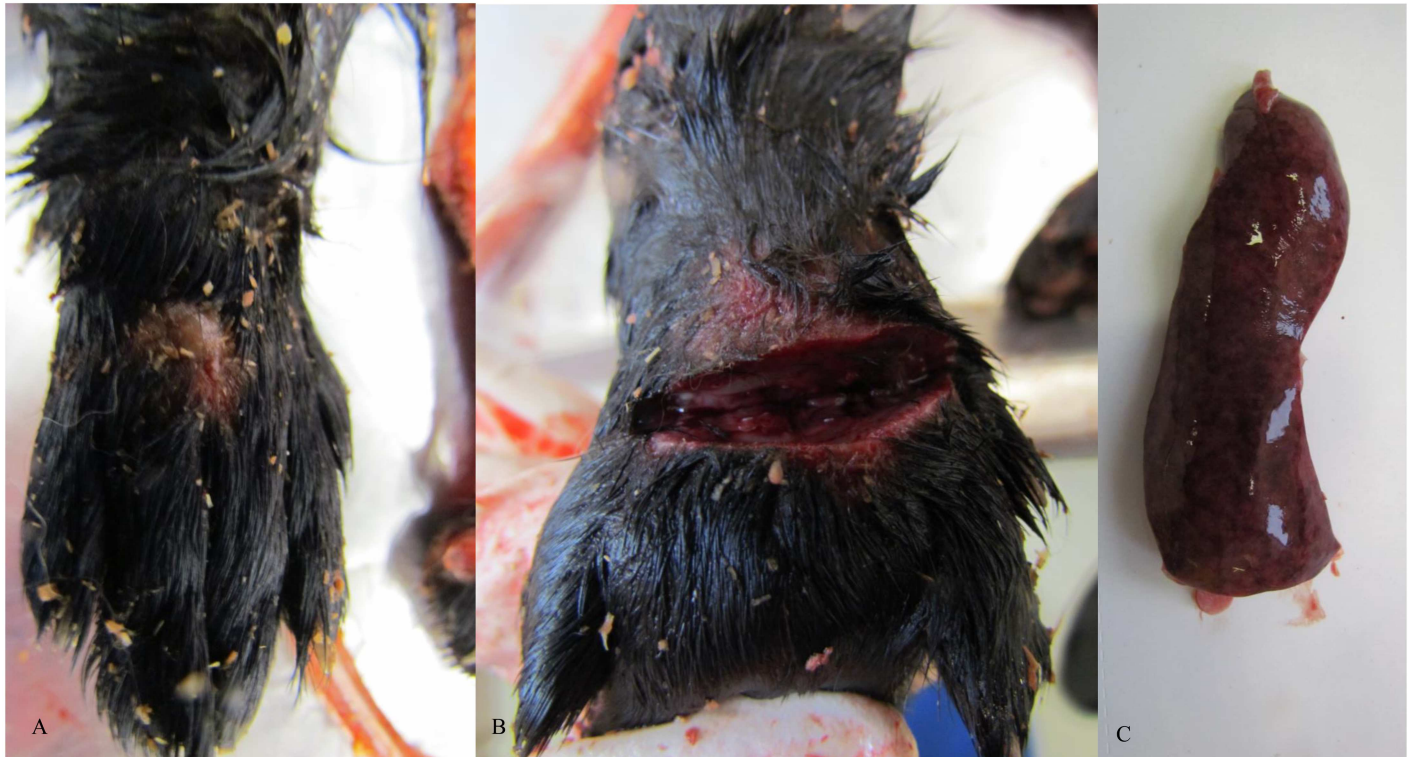
Fig 1. Gross pathological changes in infected mink. (A) Crust formation was detected in i.d./s.c. inoculation site with A. phocae . (B) A incision made in the inoculation site of i.d./s.c. inoculation with A. phocae and novel Streptococcus sp. revealed oedema, necrosis and haemorrhages and pus formation in the skin and in the subcutaneous tissues. (C) Enlarged spleen with mottled surface was detected in mink inoculated with both A. phocae and novel Streptococcus sp. Splenomegaly is a typical change in clinical cases of FENP.