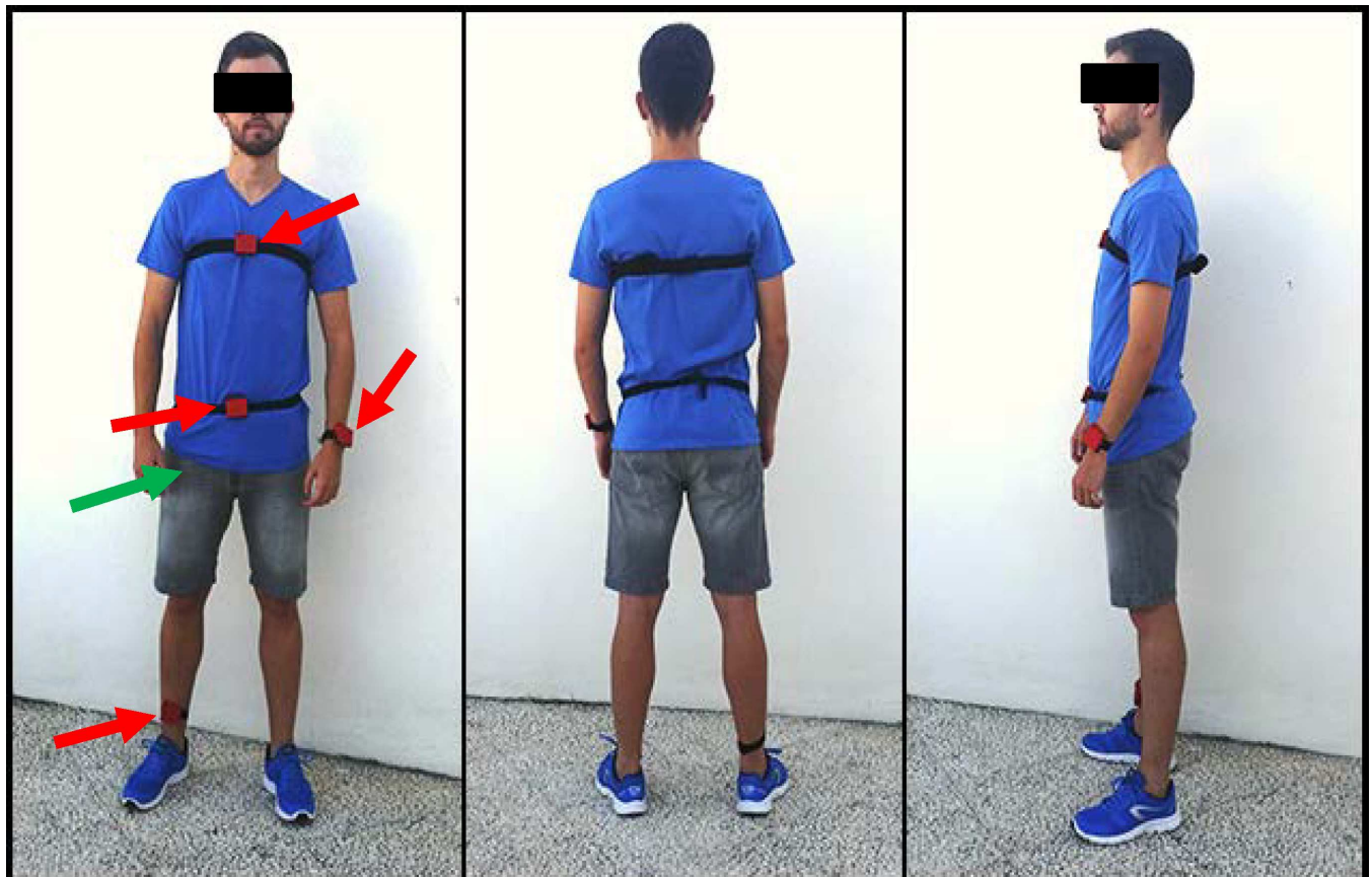
Fig 2. Experimental subject with the multisensory system.

Every subject executed a set of 7 predetermined ordinary ADLs: normal walking, light jogging, body bending, hopping, climbing stairs (up and down), lying down (and getting up) on (from) a bed, and sitting down (and up) on (from) a chair. In addition all the subjects except two (those who were older than 50 years) emulated 3 different categories of falls (lateral, frontal and backwards) on a mattress. For both ADLs and simulated falls, the initial position of the