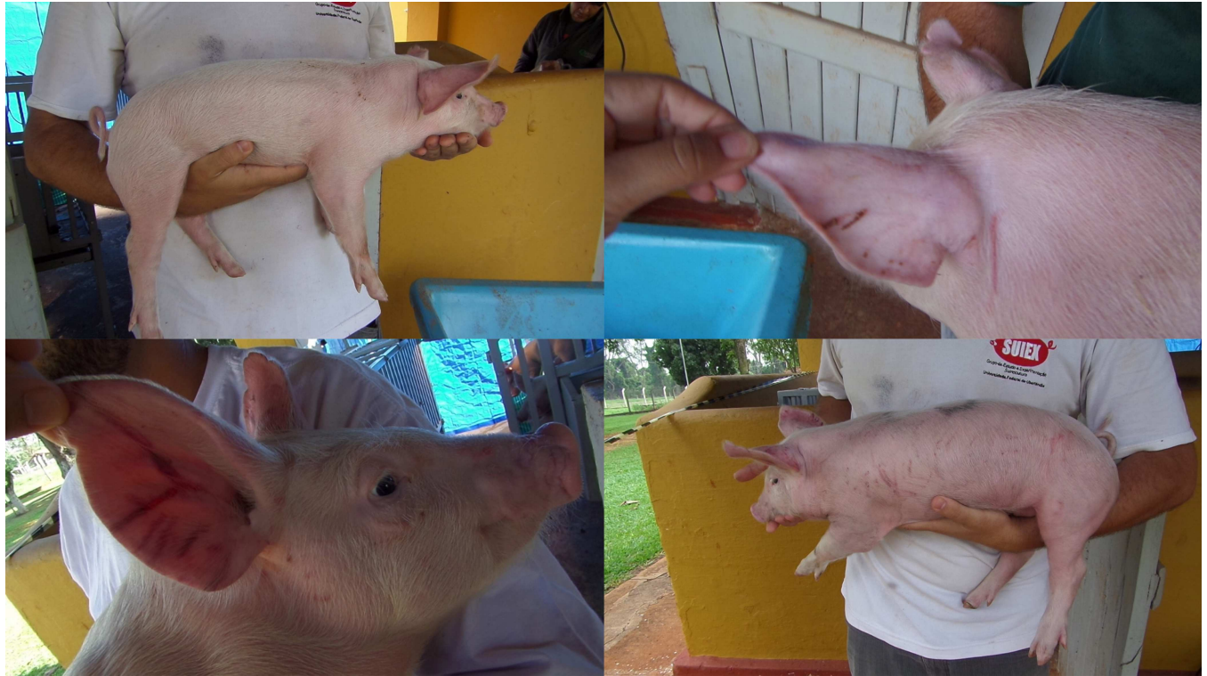
Fig 1. Pictures used to measure the skin lesions