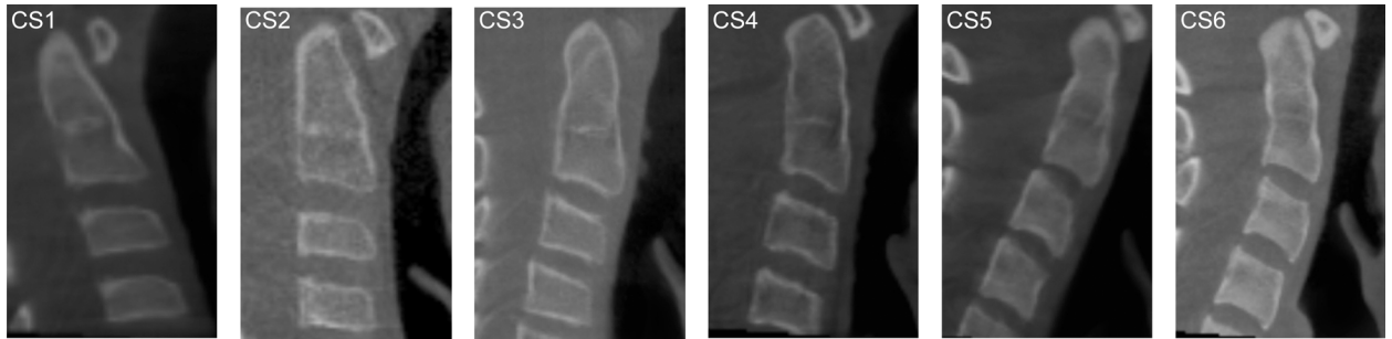
Fig 1. Cervical vertebrae maturational stages (CVM method). A) CS1 B) CS2 C) CS3 D) CS4 E) CS5 F) CS6).