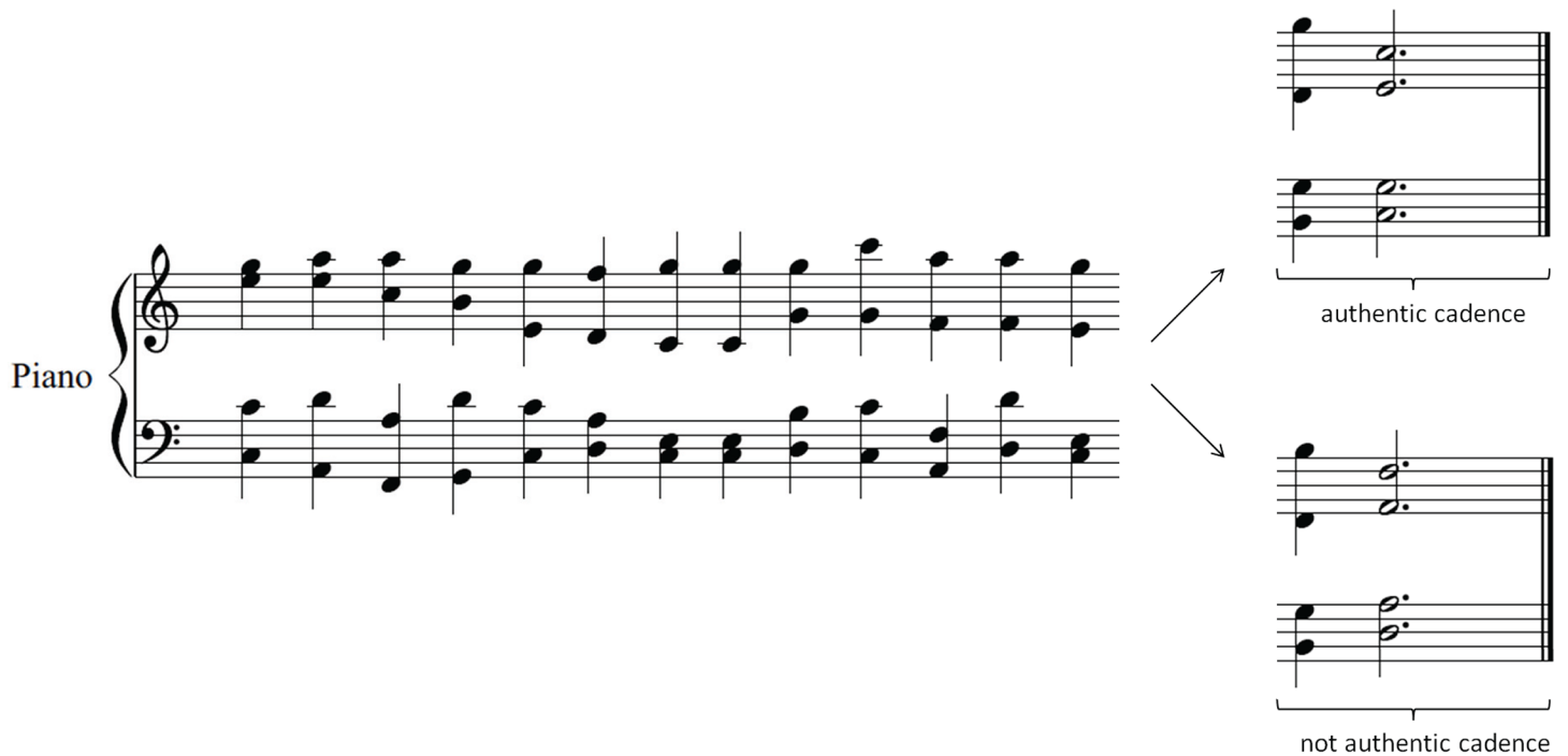
Fig 1. Musical task item. Participants are required to rate the closure (feeling of completion) of chord progressions ending either on an authentic cadence (top ending) or not (bottom ending), i.e. a dominant followed by a supertonic (shown here) or followed by a subdominant (not shown). Accuracy refers to the average rating of sequences ending on an authentic cadence minus the average rating of no cadence endings.