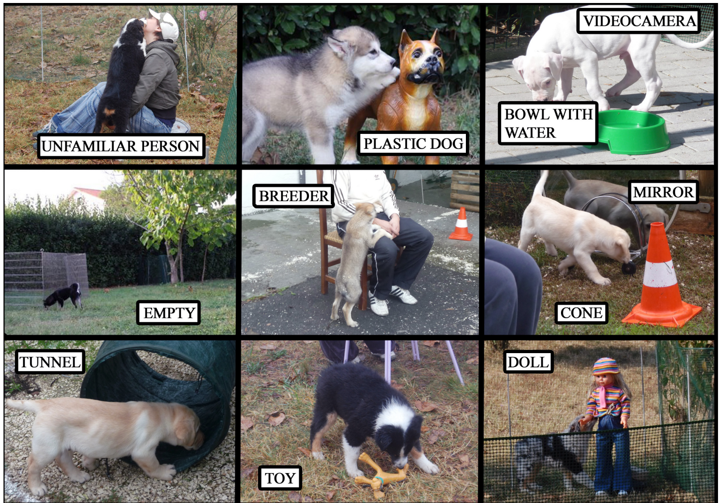
Fig 1. Stimuli and setup in the modified open-field test.