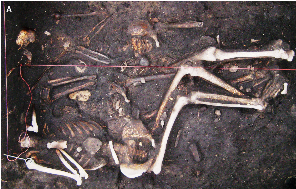
Fig 1. Original photograph of the triple-inhumation regarding the three male soldiers (Brandenburg, Germany), dated to the Thirty Years' War (1618–1648).