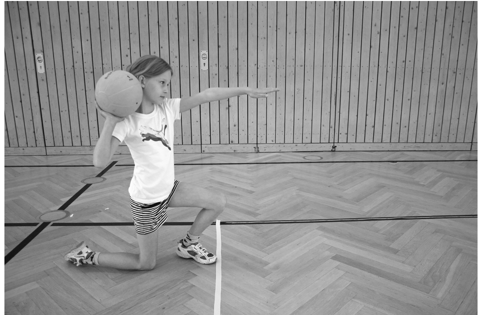
Fig 1. Schematic description of the ball push test. Note. The individual that is shown has given written informed consent (as outlined in PLoS ONE consent form) to publish these case details.