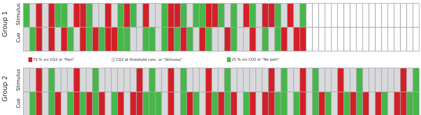
Fig 1. Graphical scheme of the experimental settings applied in either group 1 (top bars) or group 2 (bottom bars) subjects. The paradigm applied to either group is shown in each two lines of differently colored small bars of which each denotes a CO 2 stimulus and the associated cues. Specifically, in the upper lines, the CO 2 stimuli are shown in their chronological succession differently colored for 25% v/v CO 2 stimuli (green), CO 2 concentration at the individual pain threshold level (grey) and 75% v/v CO 2 (red). Below each stimulus, in the second line the cues given before stimulus application are denoted as “No pain” (green), “Stimulus”, i.e., a neutral cue (grey) and “Pain” (red). In the first group, the far-from-thresholds stimuli were cued randomly, i.e., green and red bars in lines 1 and 2 are mixed, whereas in the second group, the 25 and 75% stimuli were always preceded by correct cues, which can be seen by the consistent agreement between green or red bars in lines 1 and 2. The inequality of the experimental settings between the groups is commented on in the discussion of this paper.

The cues were given randomly, i.e., both the 25% v/v and the 75% v/v CO 2 stimuli were randomly announced as “no pain”, neutral (“stimulus”) or “pain” (n = 5 per condition; group 1; for details, see Fig 1), meaning that several of the 75% CO 2 stimuli were announced as non-painful, despite their clear painfulness, and several of the 25% CO 2 stimuli were announced as painful, although the evoked pricking sensations were clearly below the pain threshold. This paradigm served to create a context of questioning the cues thus arousing mistrust. The details of the stimulation and cue paradigm are shown in Fig 1 (top). To interpret the results, a second group (group 2) was assessed. In this group, the 25 and 75% CO 2 stimuli were always announced correctly, i.e., the 25% v/v stimuli were announced as “no pain” and the 75% v/v stimuli as “pain”. This paradigm excluded the application of the neutral cue for the far from pain thresholds stimuli. Thus, the total number of stimuli for group 1 was 45 stimuli (15 threshold stimuli and 15 far-below and far-above threshold stimuli, respectively), whereas subjects of