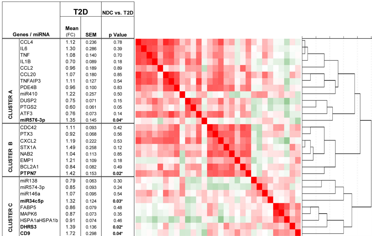
Fig 1. Hierarchical cluster analysis of the tested genes and microRNAs of the monocytes of Ecuadorian type 2 diabetic patients and controls in the validation cohort. On the left, the fold change values between the T2D group and the non-diabetic controls were determined from normalized Ct values (Ct gene/Ct reference gene ABL) by the \Delta\Delta Ct method ( 2^{-\Delta\Delta Ct} , User Bulletin 2; Applied Biosystems, Foster City, CA). Data were standardized to the non-diabetic control subjects. The fold change of each gene in the non-diabetic control subjects is therefore 1. Differences between groups were tested using t tests for independent samples. This table shows that 2 microRNAs (MiR-34c-5p and miR-576-3p) were significantly higher expressed in the monocytes of the T2D patients compared to non-diabetic controls. Also, 4 genes (of the 24 tested) were significantly different expressed (PTGS2 lower, and CD9, DHRS3 and PTPN7 significantly higher). The heatmap and dendrogram present the result of the hierarchical clustering of the genes. Three major clusters were found: Cluster A contains inflammatory compounds and includes miR-410 and miR-576-3p. Cluster B contains inflammatory compounds and factors involved with migration/differentiation/metabolism; Cluster C only consists of migration/metabolic factors. MiR-138, miR-574-3p, miR-146a and miR-34c-5p formed a sub-cluster within cluster C and strongly clustered together.