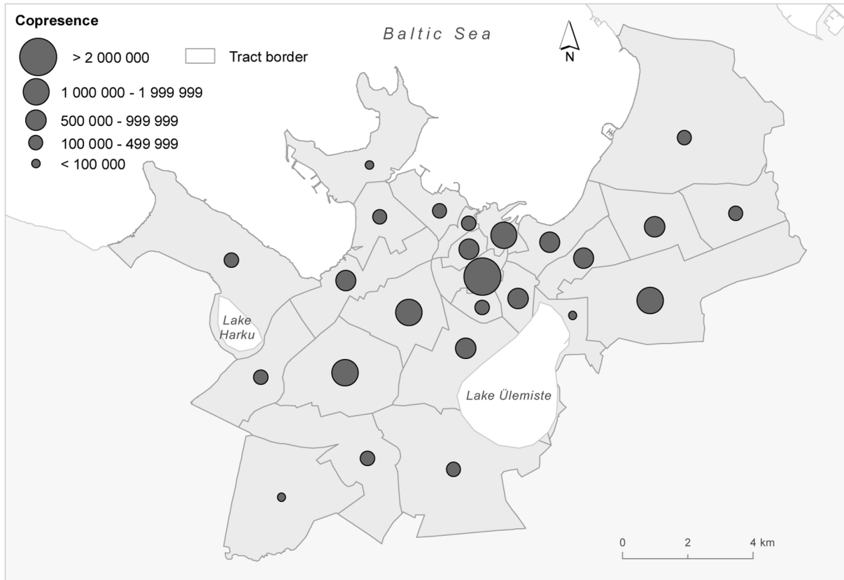
Fig 1. Estonian-Russian Copresence during free-time by city tract. The study area, Tallinn city, is shaded and tract boundaries are marked in dark gray. Copresence is measured in number of meetings in the sample over the observation period ( \sum_{j < i} p_{ij} in the sense of expression Eq (1)).