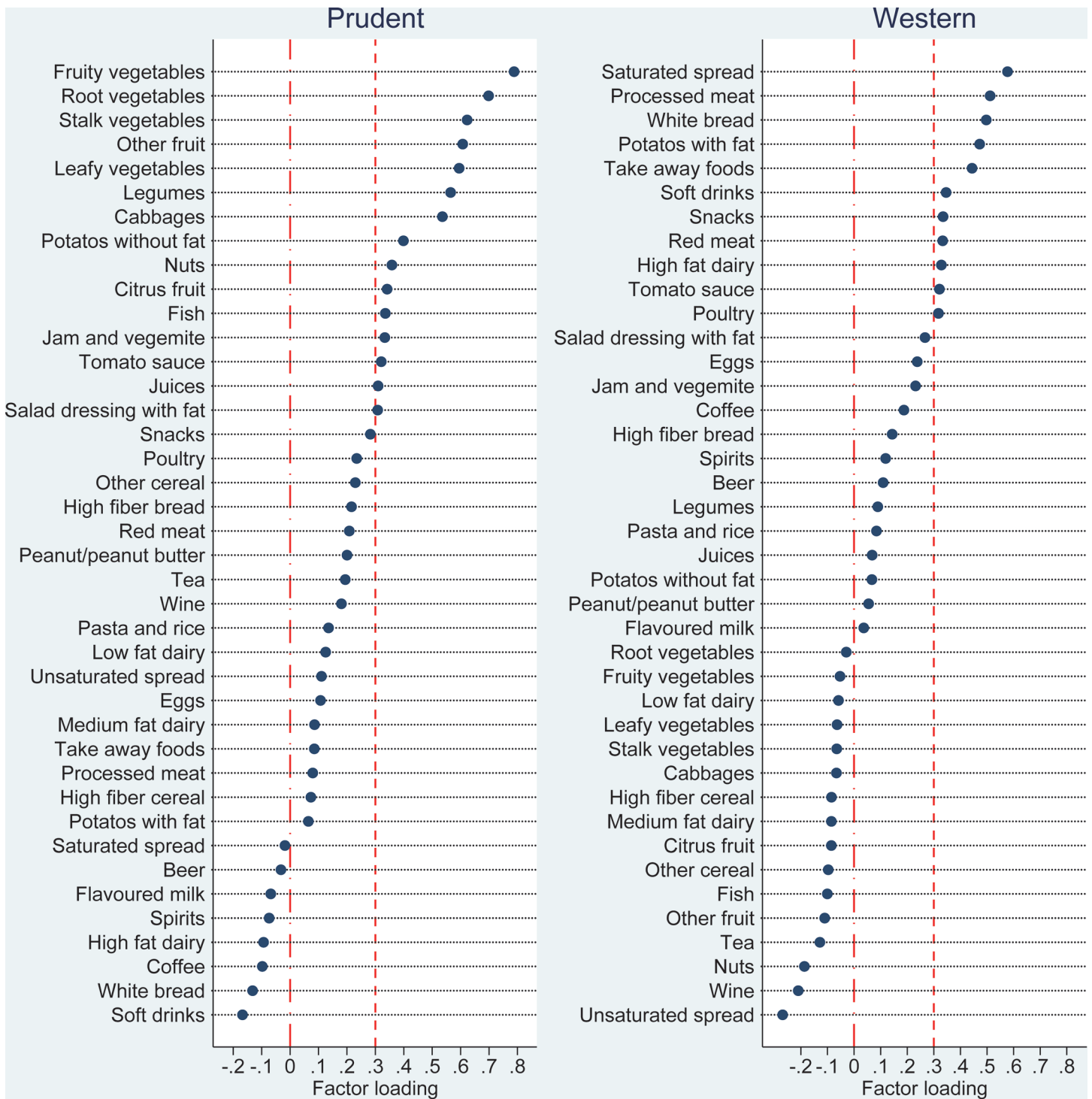
Fig 1. The factor loadings of factor analysis for dietary patterns. Two dietary patterns which are prudent and western dietary pattern were generated using the principle component factor method of factor analysis.