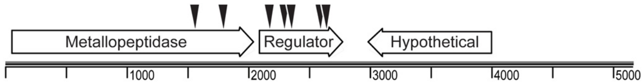
Fig 1. Open reading frame (ORF) map of the insert of metagenomic clone \beta LR16. Gray triangles designate the locations of transposon insertions that eliminated the resistance phenotype.