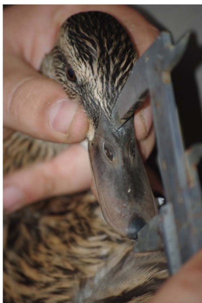
Fig. 3. Measurement of bill length. Bill length was measured (to nearest 0.01 millimeter) along the dorsal side of the maxilla using a caliper.

values >15.065 , all p < 0.001 ) (Table 3). When males and females were considered separately, there was an effect of group within males in position 2 ( r^2 = 0.052 , F_2 = 4.133 , p = 0.019 ). Post-hoc tests revealed that historical wild males had significantly higher lamellar density than farmed mallards ( p = 0.020 ), historical wild mallards also tended to have a higher lamellar density than present-day wild mallards for the same position ( p = 0.051 ). No significant differences were found in any other position in either sex ( p > 0.116 ) (Table 3).