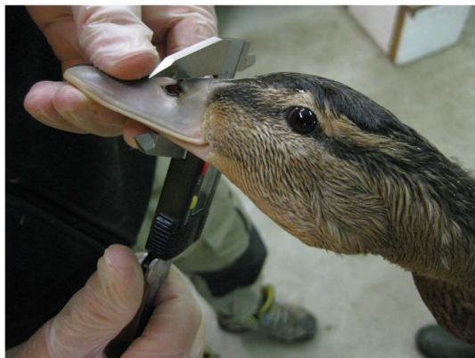
Fig. 2. Measurement of bill height and width. Bill height and width were measured (to nearest 0.01 millimeter) over the center of the nostrils with a caliper.