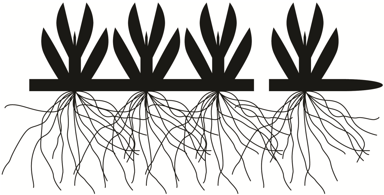
Figure 1. Collection of adult plants of C. edulis . doi:10.1371/journal.pone.0107557.g001

and residual soil effects on the limitation of native flora by an invasive plant.