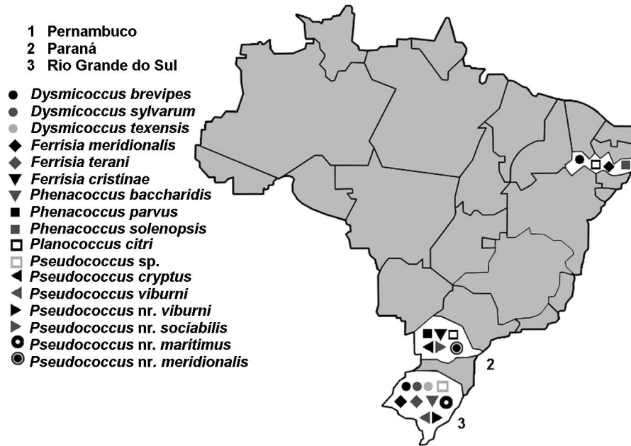
Figure 2. Distribution of mealybug species in vineyards in the Paraná, Pernambuco and Rio Grande do Sul states (Brazil). doi:10.1371/journal.pone.0103267.g002

Pernambuco and Rio Grande do Sul, the same multilocus haplotype being identified in both regions. This is the first record of this species in Brazil, but it has previously been found in Argentina, Chile, Paraguay and Uruguay [35].