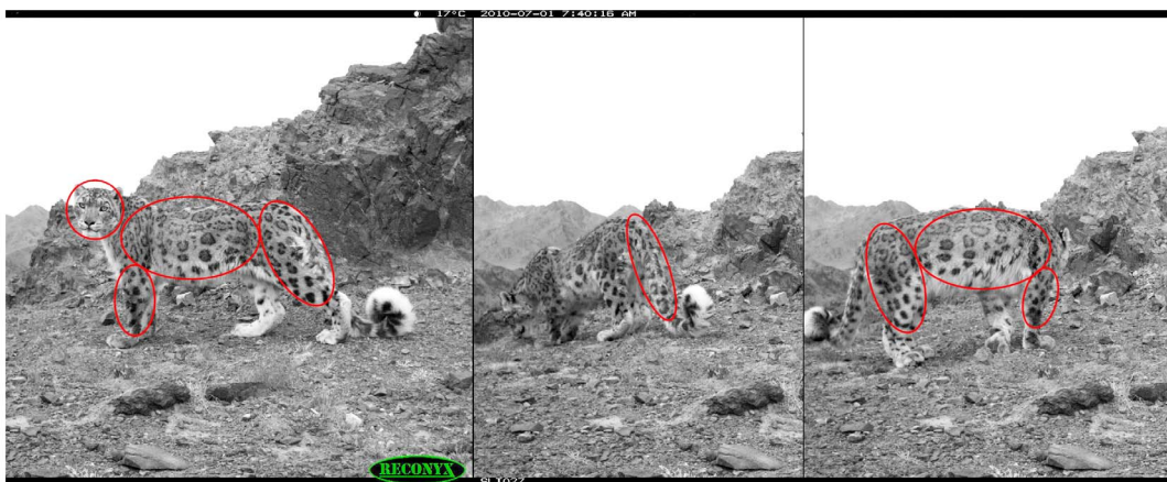
Figure 3. Multiple images with more than one body part of the snow leopard could be photographed using a single camera trap capable of taking multiple images rapidly (<1 second intervals). Here we show 3 out of the 30 different photos of a male snow leopard taken on the same encounter during the 2 minutes that he lingered in front of the camera. These images were used to create references for identifying 8 body parts, including face, tail, and both flanks, hindlegs and forelegs of this particular snow leopard.

for the multi-season analysis. This resulted in a secondary sampling period of 16 days for 2009, and 32 days each for 2010, 2011 and 2012. For each primary sampling period (year) we thus obtained 8, 16, 16 and 16 secondary sampling periods, respectively, by pooling the one-day sampling occasion capture histories into two-day sampling occasions capture histories. The snow leopard populations were expected to be open to changes between primary sampling periods (i.e. years) while we assumed