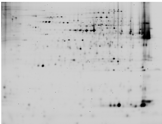
Figure 3. Hepatic proteome of the newly-hatched chick. Visualization of the total number of spots in the hepatic proteome of the newly-hatched chick on a Cy2 image (pooled sample) of an analytic two-dimensional gel electrophoresis (2-D DIGE) gel. doi:10.1371/journal.pone.0094902.g003

As synthesis and degradation of glycogen are vital for embryonic survival during the last phase of incubation [21], glycogen levels were determined in liver, the most metabolically active tissue of the embryo. Although no significant effects of treatment or an interaction with age could be observed, the albumen-deprived chicks had lower hepatic glycogen content at hatch as compared to both the control and the sham group, suggesting that the released glucose can be distributed to extra-