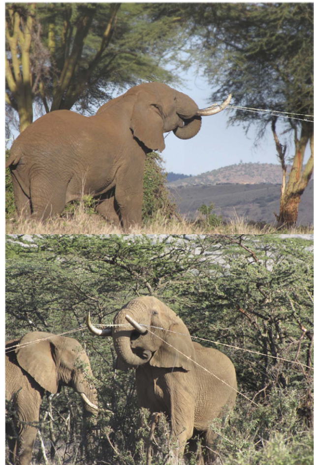
Figure 1. (Top) Fence-breaking elephant in Lewa Wildlife Conservancy attempting to snap two strands of wires by pushing them upwards. (Bottom) The partner elephant is busy crawling below the live wire. The photos were manipulated to highlight the wires, which were not very clear in the originals.

Four of the most destructive elephants (the 10 males that caused the highest number of fence-breaking incidents out of the total 67