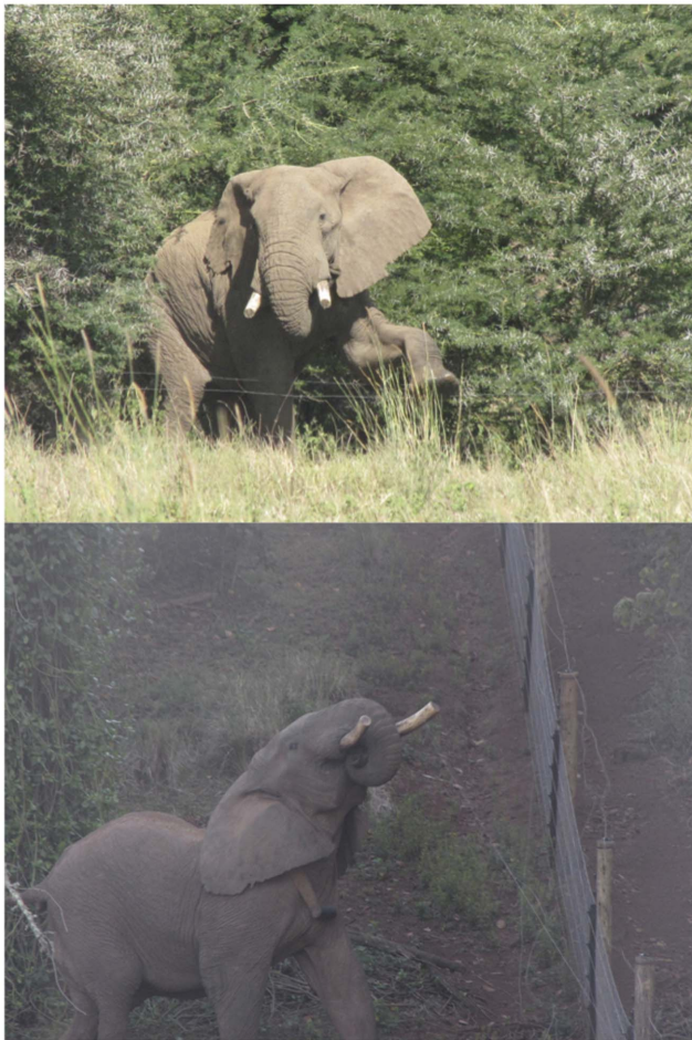
Figure 4. (Top) Right Notch (fence-breaker elephant) breaking an electric fence after detusking using his legs and trunk. (Bottom) Mountain Bull attempting to break an electric fence after detusking using the shortened tusks. doi:10.1371/journal.pone.0091749.g004

data collection [31]. Our data show that fence-breaking is not practiced by all the elephants that range near fences; rather, it is a habit acquired by just a few elephants that sometimes break fences. Only 13.4% of the total elephant population in the Conservancy damaged fences one or more times during the study period. Curiously, the majority of fence-breakers were adult females, although bulls are the cause of the majority of fence-breaking incidences; thus fence-breaking would seem to be an exceptional ability acquired by specific bull elephants, which represent only 1% of the total elephant population in the area. Our results concur with the findings of Chiyo et al. [4], who reported that fence-breaking and crop-raiding seem to be sex-biased towards males and probably depend on nutritional advantages that enhance their fitness and reproductive competitiveness [32].