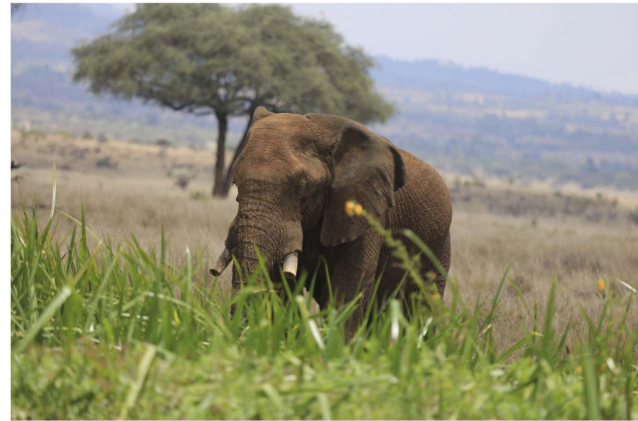
Figure 5. Photo of Mshauri (fence-breaker elephant) after detusking walking in Lewa Wildlife Conservancy. doi:10.1371/journal.pone.0091749.g005

Not all alpha females or males are problematic, even when they share territories with humans and cultivation; likewise, not all members of an elephant group are prone to attack human