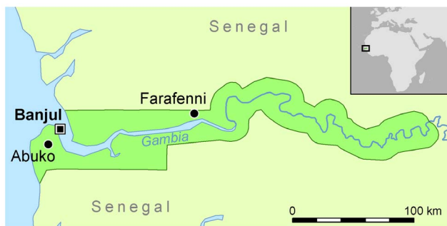
Figure 1. Geographical location of Farafenni area, Abuko and Banjul (capital city) within The Gambia, Western Africa. doi:10.1371/journal.pone.0085424.g001

Blood samples were collected from the jugular vein in evacuated blood collecting tubes of 8 ml (Greiner Bio-One, Kremsmünster, Austria), using 20 G×1.5 Multi-Sample Blood Collection needles (Greiner Bio-One, Kremsmünster, Austria). The tubes were left at ambient temperature for circa 1 hour and then stored in a cool