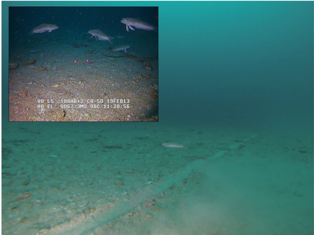
Figure 3. Screen capture of ROV footage recorded on line “C”. Main: Highly visible furrow running in a straight line along the seafloor at water depth of ca. 67 m. Note the echinoderms that have settled inside the furrow. Inset: Detail of blue cod in pursuit of ROV; scaling lasers represent 5 cm. See also ( http://vimeo.com/64689982 ).