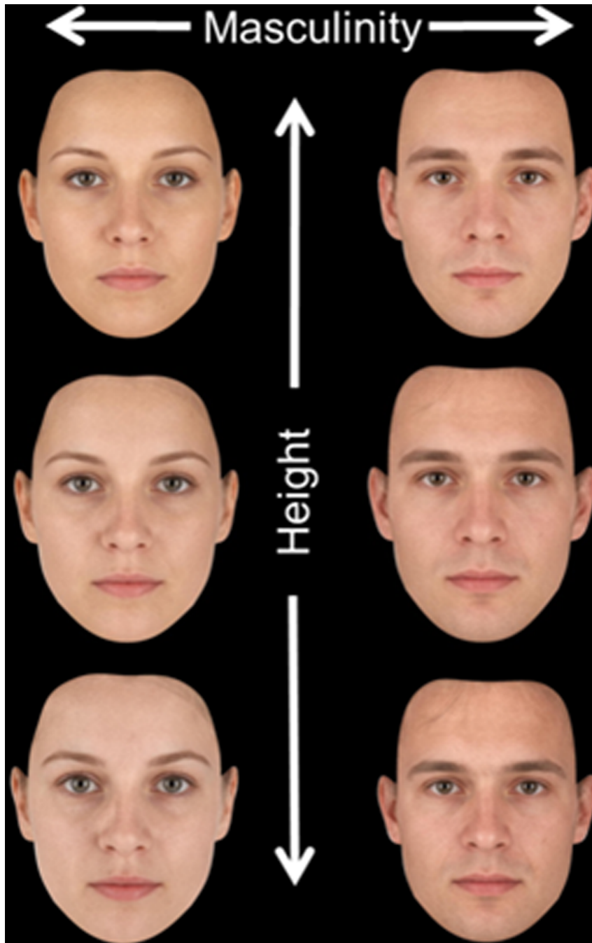
Figure 3. An averaged female and male face (middle row), and averaged faces of the 10 shortest (bottom row) and tallest (top row) individuals for each sex. Height and masculinity are morphologically distinct parameters in the face. doi:10.1371/journal.pone.0080957.g003

height, or perceived leadership ability. Study 3 differs from the previous studies in that structural masculinity is computationally calculated, and masculinity scores are then compared across height and leadership ratings collected in Study 1.