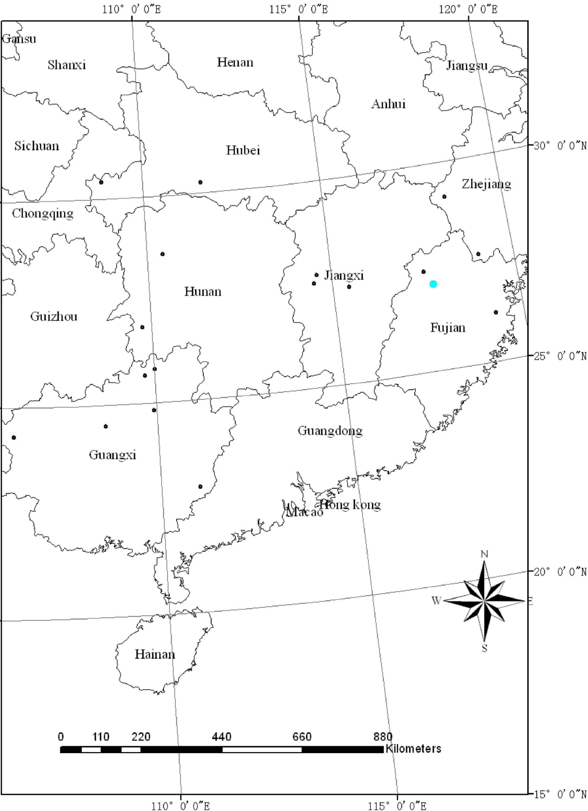
Figure 1. Geographical location of Chinese fir compiled in the published literature. The big blue dot is the location for the study site. Other black dots are the locations of published literature for studying Chinese fir biomass. doi:10.1371/journal.pone.0079868.g001