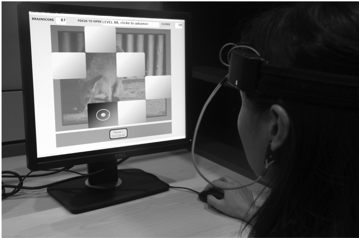
Figure 2. A model engaged in the Brain Computer Interface (BCI) memory and attention training game system. The model has given written informed consent, as outlined in the PLOS consent form, to publication of her photograph. doi:10.1371/journal.pone.0079419.g002

score at week 8 from week 1. Acceptability rate was defined as proportion of participants whose rating score to the whole system was greater than 4 (scale range 1–7).