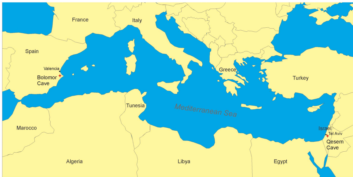
Figure 1. Location of Qesem Cave (Israel) and Bolomor Cave (Spain).