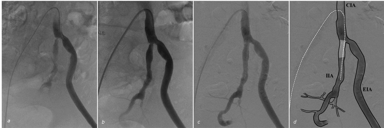
Figure 2. Treatment of a patient. (a) Digital subtraction angiography of the left common iliac artery showing a proximal stenosis of the internal iliac artery (IIA), with sub-optimal filling of subsequent branches. (b) Result after treatment with 5 and 6 mm percutaneous transluminal angioplasty, showing residual origin stenosis of the IIA of more than 30%. (c) Subsequent stent placement (Palmaz 6 mm diameter) reduced the stenosis grade to less than 30%, and provided adequate distal blood flow. (d) Overlay of Figure c showing branches of mentioned vessels, guide wire position (white dotted line) and placed stent (white mesh). CIA = Common Iliac Artery. EIA = External Iliac Artery. IIA = Internal Iliac Artery.