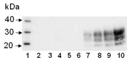
Figure 1. Detectable levels of PrP Sc on Western blots do not correlate with the levels of infectivity. 10% brain homogenates from an uninfected brain (lane 2) time-course samples week 3, 6, 9, 12, 15, 18, 21 (lane 3–9), and the terminal sample (lane 10) were digested with proteinase K at 60°C for 10 minutes and assessed by Western blot. The observed signal does not correspond with the levels of infectivity found in corresponding bioassays for the week 12–21 post-exposure time-points.

Transmission via this challenge route was shown to be efficient with 97.1% (68/70) of challenged animals succumbing to disease. When the incubation period of individual animals was plotted (Figure 2A and B), two distinct incubation-period groups were identified (Student's T-test; p < 0.001 [16], Sigmaplot version 10). The mean incubations for these two populations are shown separately in table 1B. The “early” terminal group had a mean incubation period of 166 \pm 18 days ( n = 11 ; range 140–188) whilst