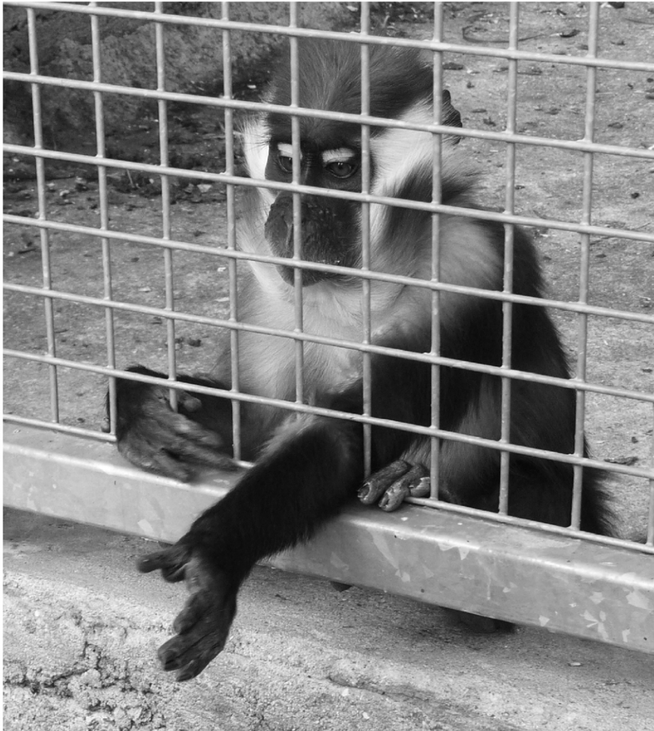
Figure 2. Left-arm begging gesture performed by George, a juvenile male red-capped mangabey. The arm is extended toward a raisin held in the experimenter's hands just out of camera range. The gesture began as soon as the wrist crossed the cage mesh. doi:10.1371/journal.pone.0041197.g002

the first block also revealed a significant main effect of the experimental condition ( F(4,32)=6.19 , p<0.001 ). Subjects produced less begging gestures in the Body Away condition than in the Eyes Open ( p=0.021 ), Eyes Distracted ( p=0.040 ) and Eyes Closed condition ( p=0.029 ). Moreover, subjects produced less begging gestures in the Head Away condition than in the Eyes Open ( p=0.021 ), Eyes Distracted ( p=0.040 ) and Eyes Closed condition ( p=0.029 ) (Figure 3).