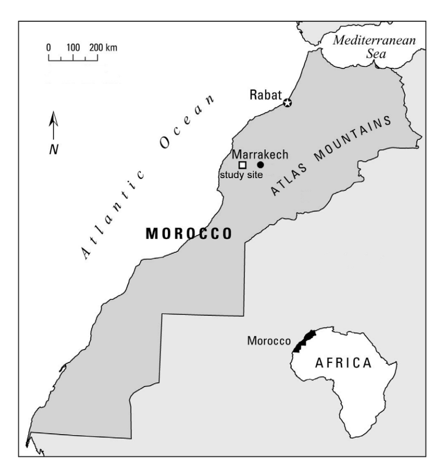
Figure 1. Map showing the geographic location of the M'Sabih Talaa Reserve, West central Morocco. The location of the study site is indicated by the square. doi:10.1371/journal.pone.0035643.g001

+fragments that are highly variable and that allow taxonomic identification via their "DNA barcode" [4,22,23].