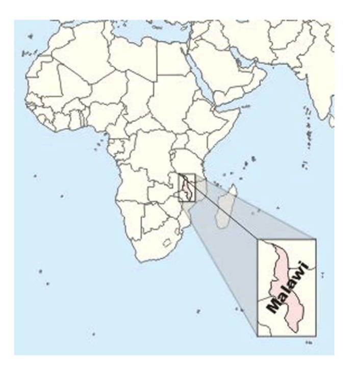
Figure 1. Map of Malawi in Africa.. doi:10.1371/journal.pone.0033765.g001

(QECH) in Blantyre. QECH is the largest hospital in Malawi. It provides all levels of care, from primary to tertiary to patients within Southern Malawi. The QECH is the only public hospital within Blantyre District. Blantyre has a population of 1 million. It is the second largest city in Malawi after the capital city, Lilongwe (figure 1) [12].