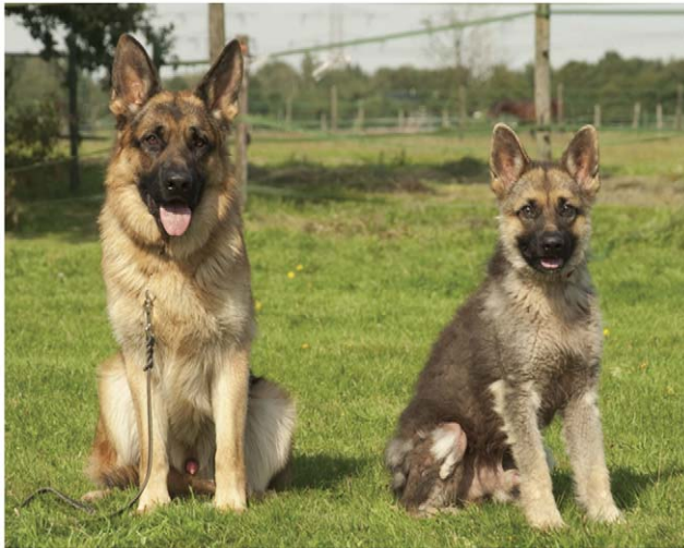
Figure 1. Two fourteen-month-old male German shepherd dogs from the same litter. A healthy German shepherd dog (C8, left) and his littermate that is affected by pituitary dwarfism (C6, right). Note the proportionate growth retardation, the retention of puppy hairs and the lack of guard hairs of the dwarf. doi:10.1371/journal.pone.0027940.g001

were monomorphic in families A and B. Eleven of the remaining markers were heterozygous in only two parents and four markers were heterozygous in three parents. There was only one marker, REN177B24 on CFA09, for which all four parents were heterozygous. The three dwarfs were homozygous for allele 366 of this marker and their analyzed siblings were heterozygous. Therefore, REN177B24 was the first marker to be analyzed further according to our selection criteria and all available dwarfs, parents, and siblings were genotyped with this marker. Three of the 23 dwarfs were not homozygous for the allele of 366 bp (D15, F4, F9). Just one out of nine available parents (D9) and one out of 17 normal siblings (D14) were homozygous for this allele. The homozygous sibling was an offspring of the homozygous parent. The frequency of the associated 366 bp allele was 94% in the group of dwarfs, 56% in the parents, and 44% in the siblings. These results showed that the dwarfism phenotype is strongly associated with marker REN177B24.