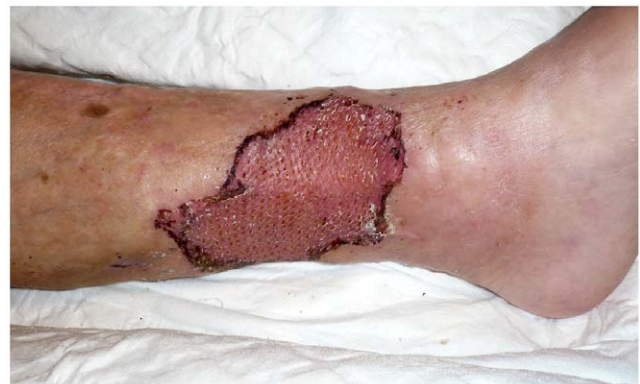
Figure 2. The same ulcer as Figure 1 five weeks post operative. The spit-skin transplant is well attached and almost completely healed. doi:10.1371/journal.pone.0020492.g002

We have examined the bacteriology assessed from the wounds from 12 weeks prior, to and during surgery. The ulcer surfaces were swabbed with a sterile charcoal swab preoperatively. During