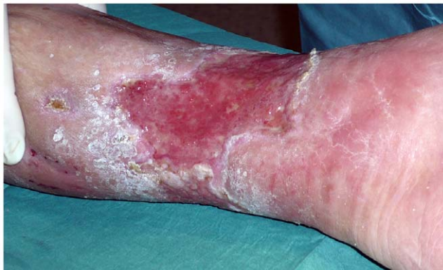
Figure 1. A venous leg ulcer at time of operation. Standard state-of-the-art treatment failed to heal the ulcer and according to our protocol the patient was offered a revision and split-skin transplant. doi:10.1371/journal.pone.0020492.g001

Ninety-five patients received autografting with meshed split-skin transplants of their lower leg ulcers of venous origin as the apparent aetiology. Thirteen of the 95 patients were excluded in our analysis. The main reason being lack of data due to their absence at the 12-week follow-up: Six patients passed away for unrelated causes in the weeks following surgery. One patient did not attend the outpatient clinic until after 9 months and 3 patients only attended it once or twice but missed out on the final appointments including the 12-week follow-up. Moreover, 2 patients exhibited pronounced non-compliance, which led to immediate rejection of the transplants and, finally, one patient was excluded due to a total lack of microbiology data. A total of 9 of the 82 patients included in our analysis required a second or third grafting during the study period for the treatment of recurrent or new ulcers. Only the first ulcer episode was included. Of the included patients, 22 had bilateral ulcers. Of these, only 9 patients were included in the study with bilateral ulcers and the remaining 13 were included with unilateral ulcers due to insufficient data as regards to which leg the microbiology was achieved from. This