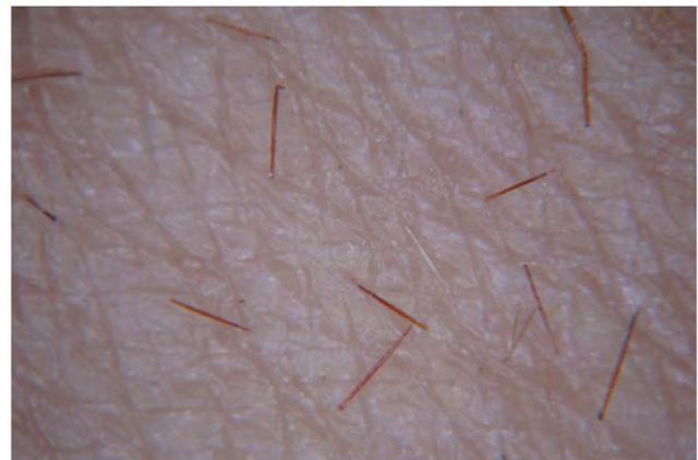
Figure 3. An image of cowhage spicules inserted into the skin by gentle rubbing, under polarizing light at 5\times magnification. doi:10.1371/journal.pone.0017786.g003