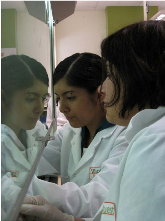
Figure 1. BioQuest Academy student extracts M. smegmatis mRNA with mentor assistance. doi:10.1371/journal.pone.0013814.g001