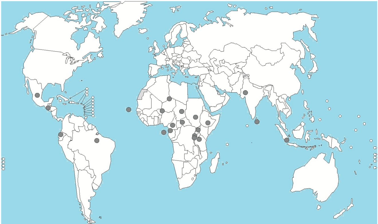
Figure 1. Countries where podoconiosis is endemic or has been described. doi:10.1371/journal.pntd.0002301.g001