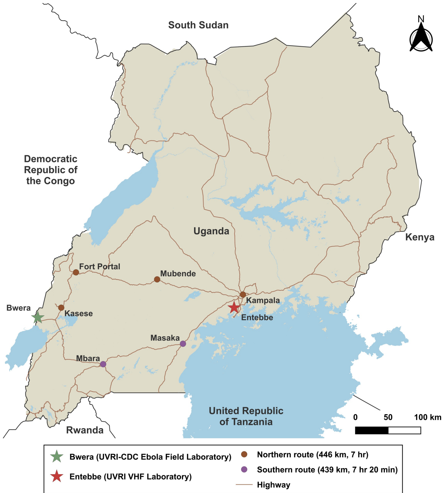
Fig 1. Map depicting the travel time to transport patient specimens by vehicle from the Uganda Virus Research Institute-United States Centers for Disease Control and Prevention Ebola Field Laboratory in Bwera to the UVRI Viral Hemorrhagic Fever Laboratory in Entebbe. The map was created using QGIS version 3.20.1 ( https://www.qgis.org ). The Uganda basemap (uga_admbnda_ubos_20200824_SHP.zipSHP) was obtained from The World Bank Data Catalog ( https://data.humdata.org/dataset/uganda-administrative-boundaries-admin-1-admin-3?force_layout=desktop ).

https://doi.org/10.1371/journal.pntd.0009967.g001