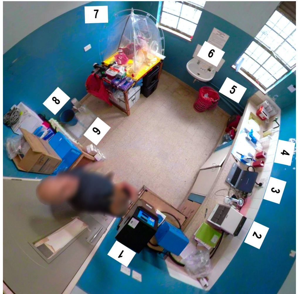
Fig 3. Fisheye view of the Uganda Virus Research Institute-United States Centers for Disease Control and Prevention Ebola Field Laboratory at Bwera General Hospital. Beginning at the door and moving counterclockwise, the major pieces of equipment and work areas that comprised the field laboratory included: 1) uninterruptable power supply with four large batteries, 2) GeneXpert Instrument, 3) GeneXpert-specific computer, 4) inactivated diagnostic specimen work area, 5) general laboratory waste, 6) sink for washing hands, 7) rapid containment kit used for specimen handling and viral inactivation of specimens, 8) designated area for decontamination of tertiary and secondary specimen transport containers, and 9) storage area for extra laboratory supplies.

https://doi.org/10.1371/journal.pntd.0009967.g003