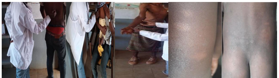
Fig 2. Physical examination of individuals suspected for leprosy based on cardinal signs at leprosy clinic, Fedis district, 2019.

This study revealed the high prevalence of hidden leprosy in the general population. All co-prevalent patients were detected without having significant neuronal or visible physical