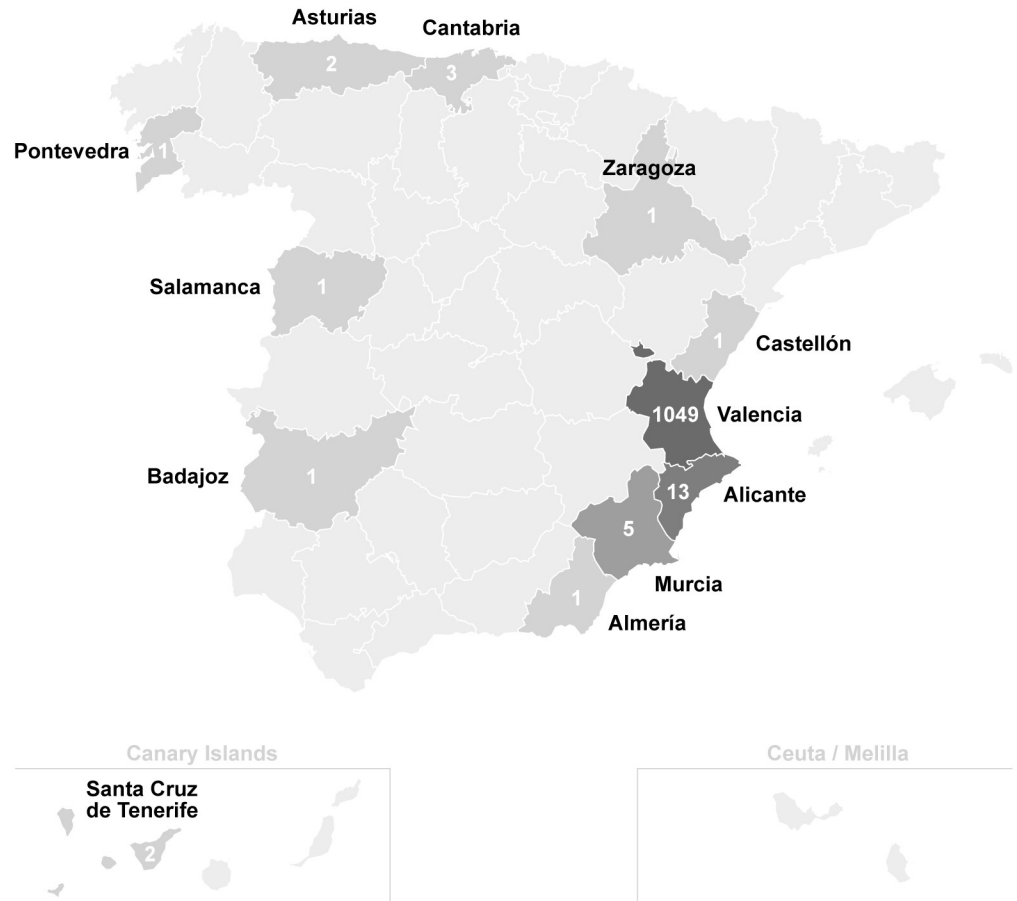
Fig 1. Geographical distribution of autochthonous Strongyloides stercoralis infection in Spain. The map was obtained from the open access website http://mapsvg.com/maps .

https://doi.org/10.1371/journal.pntd.0007230.g001