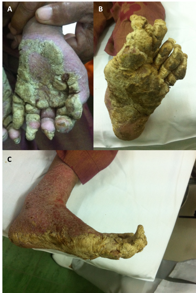
Fig 1. Extensive generalized hyperkeratotic plaques over the hands and feet. (A) Left hand palmar view. (B) Left foot plantar view. (C) Left foot medial view.

https://doi.org/10.1371/journal.pntd.0005543.g001