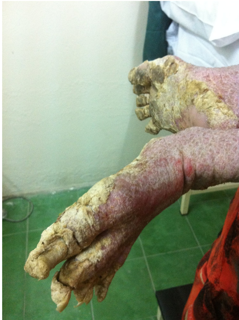
Fig 2. The deformed crusted plaques over the lower extremities made her unable to walk.

https://doi.org/10.1371/journal.pntd.0005543.g002