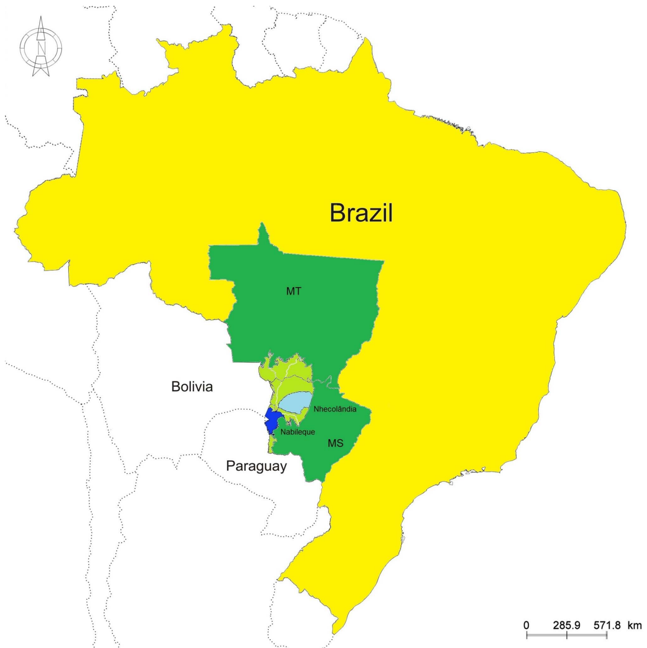
Figure 1. Pantanal located in west-central Brazil. Pantanal located within the states of Mato Grosso (MT) and Mato Grosso do Sul (MS) is shown in light green. Nhecolândia and Nabileque sub-regions, where a serosurvey for flaviviruses was conducted in equines, sheep and caimans in 2009 and 2010 are shown in light and dark blue respectively. doi:10.1371/journal.pntd.0002706.g001

samples had PRNT 90 titer <10 and one <40 for WNV (low sample volume of the latter required testing at a lowest dilution of 1:40). From 238 sheep samples tested, 235 had PRNT 90 titers < 10, two showed low neutralizing antibodies titers of 20 and 10 and one <40. From 760 equine samples initially screened for flavivirus-reactive antibodies by blocking ELISA, 396 (52.1%) were positive. When this subset was tested using PRNT 90 , 332 (43.7%) had neutralizing reactivity (PRNT 90 titer ≥10) for ILHV, 251 (33%) for SLEV, 172 (22.6%) for WNV, 139 (18.3%) for CPCV, 130 (17.1%) for ROCV, 62 (8.2%) for IGUV, 14 (1.8%) for YFV, 12 (1.6%) for BSQV, four (0.5%) for DENV-1, three