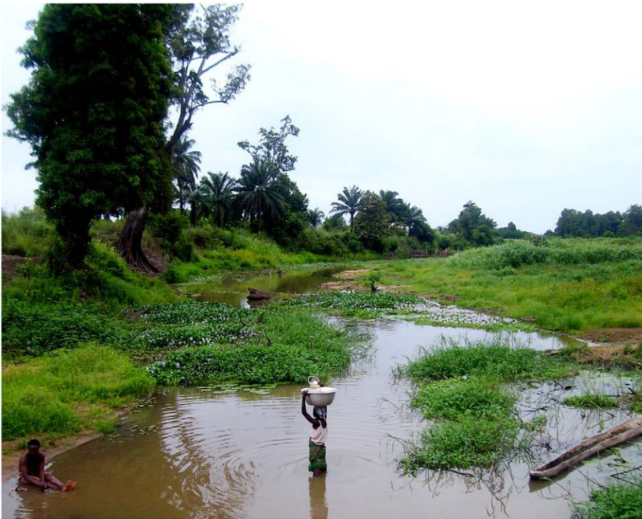
Figure 2. Typical Buruli ulcer riverine endemic sites in Ghana and Benin, respectively.