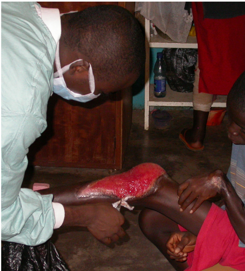
Figure 1. Buruli ulcer on leg and contractual deformity on wrist and hand. (Photo by R. Kimbrauskas). doi:10.1371/journal.pntd.0000911.g001

M. ulcerans is a slow-growing environmental mycobacterium that can be isolated from primary lesions after a 5–8 week incubation period, although up to 6 months may be required [43,44]. M. ulcerans falls into a group of closely related mycobacterial pathogens which comprise the M. marinum complex. The M. marinum complex contains mycobacterial species pathogenic for aquatic vertebrates and includes M. marinum (fish), M. pseudoshottsii (fish) and M. liflandii (frogs) [45–48]. All of these species are characterized by slow growth rates and low optimal growth temperatures [49]. From a genomic standpoint, the species in the M. marinum complex can be considered a single species based on the fact that they share over 97% identity in the 16sRNA gene sequence [50]. However, practical considerations have led to the