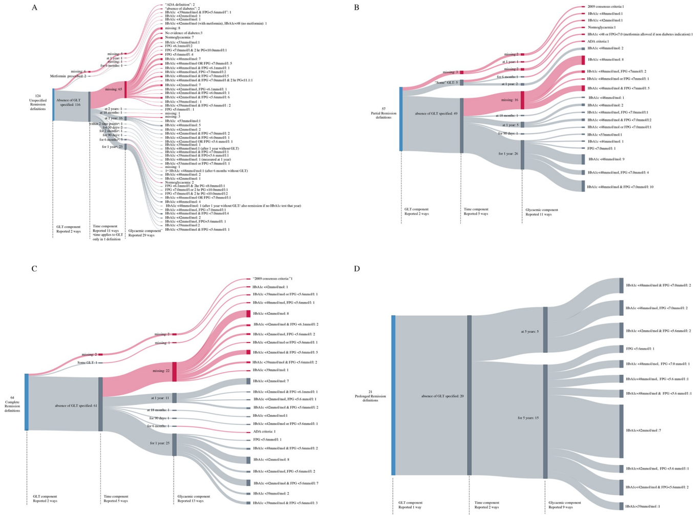
Fig 2. Sankey diagrams showing heterogeneity in definitions of remission. (A) Unspecified remission. (B) Partial remission. (C) Complete remission. (D) Prolonged remission. Red indicates a definition that has 1 or more missing (i.e., undefined or ambiguously defined) component. GLT, glucose-lowering therapy.

https://doi.org/10.1371/journal.pmed.1003396.g002