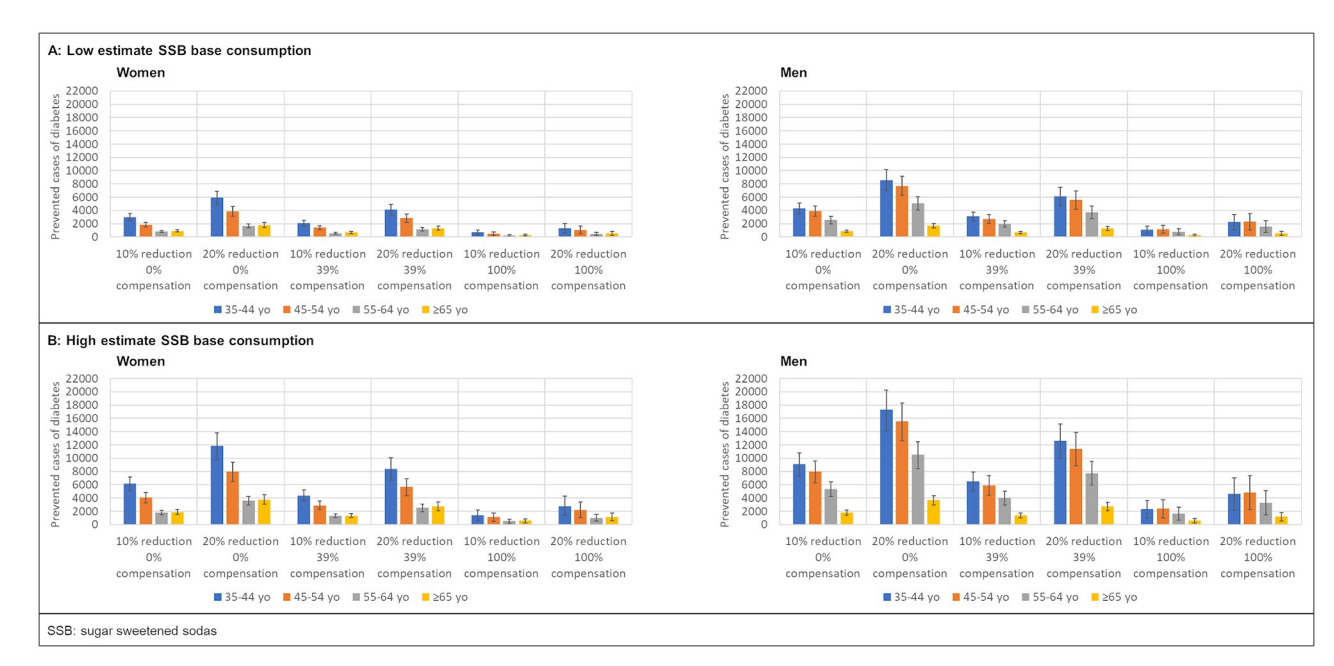
Fig 2. Projected prevented cases of diabetes by age group and gender for the period 2015–2024 under 6 different scenarios of SSB reduction in consumption and caloric compensation and 2 estimates of baseline SSB consumption. SSB, sugar-sweetened soda.

from the same scenario in Argentina. This large difference is likely due to the size of Mexico's population (almost 3 times larger than Argentina's) [45,46], a higher average daily SSB consumption in the Mexico analysis (that additionally included all sugary drinks), and a current higher rate of obesity in Mexico. In 2013, Mexico implemented an excise tax on soft drinks; estimates