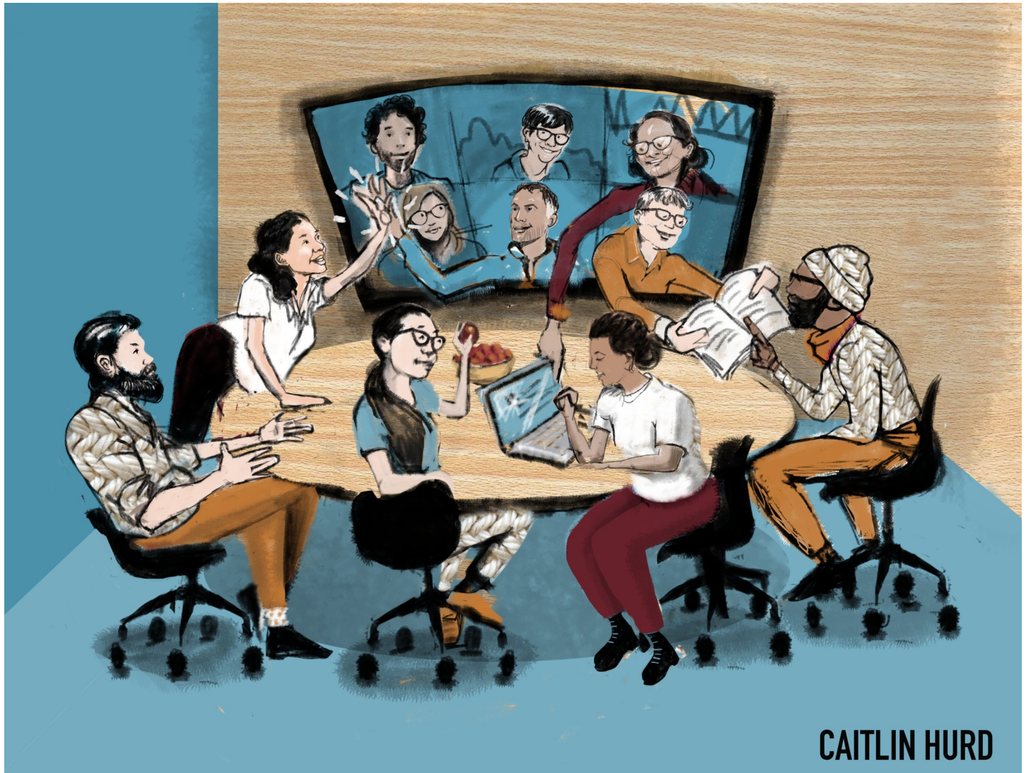
Fig 1. At the time of this publication, our lab meetings typically consisted of one principal investigator, 5–10 graduate students, one postdoctoral fellow, some undergraduates, and a few visiting students. Prior to the COVID-19 pandemic, the meetings had a mix of in-person and virtual attendees to maximize inclusion and accessibility, and attendees frequently brought snacks to share if they desired to do so. At the onset of the pandemic, our lab meetings demonstrated adaptability (see Rules 3 and 10) by shifting into a fully virtual environment (Box 1). In weekly meetings throughout the semester, our typical format has lab members rotate as meeting facilitators each week by leading a journal article discussion, discussing a topic of interest to lab members (e.g., career guidance, science communication, issues of diversity, equity, inclusion, and justice), or getting feedback on a current research effort (e.g., manuscript draft, upcoming presentation, defense rehearsal). Each meeting begins with an icebreaker to foster supportiveness and a brief reflection on our discussion ground rules to collectively recommit to meetings that are open, mindful, and respectful. Illustration credit: Caitlin Hurd.

https://doi.org/10.1371/journal.pcbi.1008953.g001